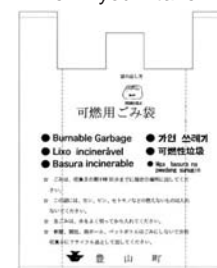
Figure. Burnable garbage plastic bags

Be sure to put the garbage in a town-designated bag and tie it closed when you take out the garbage.