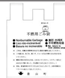
Figure. Non-burnable garbage plastic bags (Pink)

Get on from stops in the town. It takes 30 to 40 minutes to Nagoya Sakae, Aichi Kencho (Prefectural Office) Mae, and Kurokawa.